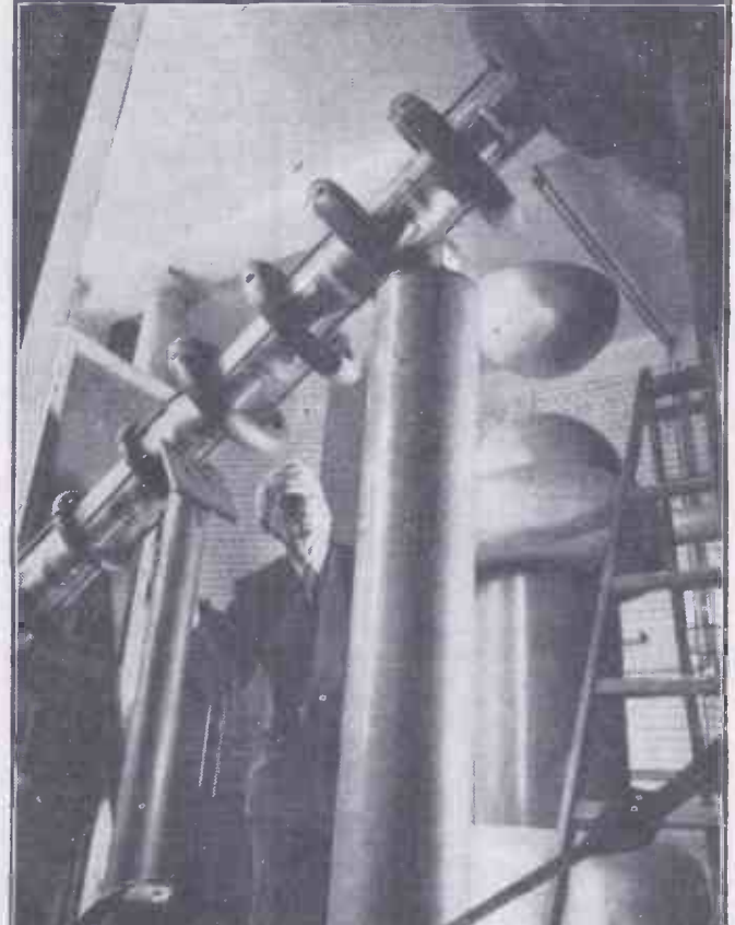
electricity—as against Professor Sir George Thomson, F.R.S., looks at the accelerating tube 60 per cent. for of a Van de Graaff generator in the Imperial College of Science distribution and ad-laboratory. This type of machine produces deep-penetrating X-rays ministration: In many which are of great help in experiments for the treatment of cancer.

The first practical use of controlled atomic power is, paradoxical as power is, paradoxical as this may sound, likely to be in countries which are not greatly industrialised. With our present methods atomic power is rather more expensive than power derived from Research will coal undoubtedly bring down the cost so that atomic power becomes much cheaper than power from coal. But the fundamental fact remains that in this generation of electricity and the manufacture of goods, the cost of power is only one item. Fuel accounts only for about 40 per cent. of the cost of our manufactures the ex-